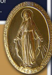
The Miraculous Medal

Because it is a gift that Mary said “ yes ” to God and bore his Son, Jesus!