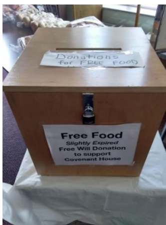
Free Bread on Fridays

Our Catholic tradition is that we dress up nice for Sunday Mass . This may be somewhat uncomfortable for some people, but we do it to honour Our Eucharistic Lord. If you had a meeting or gathering with the Queen of England, would you dress for comfort, or to appeal to the opposite sex? Would you appear as if you were going to the beach or to the park? The Queen of England is as nothing compared to the King of Kings, Jesus Christ, truly present in every Catholic Church. If we make our Sunday Mass attendance an occasion to celebrate our meeting with Jesus, and we do it with great dignity, including how we dress, then God will bless our efforts to honour Him and we will be a good example to those around us.