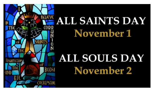
All Saints and All Souls Days

All Saints Day falls on Monday (November 1) and All Souls Day falls on Tuesday (November 2). On both of these days, in addition to our morning 9:00 am Mass we will also have an evening Mass at 7:30 pm.