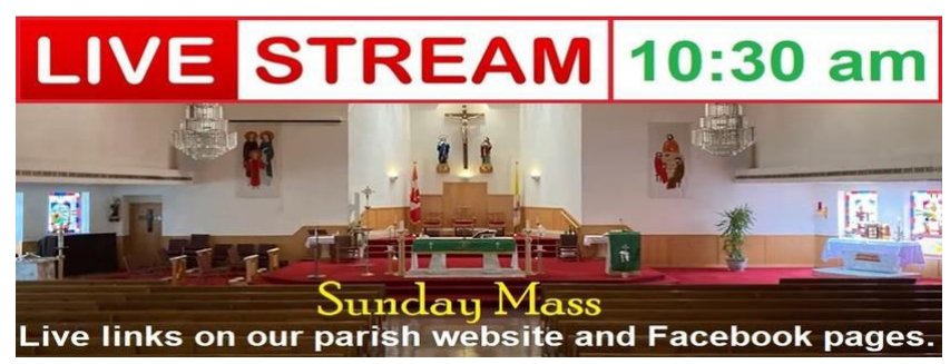
Live Streaming of Sunday 10:30 am Mass

All Saints Day falls on Monday (November 1) and All Souls Day falls on Tuesday (November 2). On both of these days, in addition to our morning 9:00 am Mass we will also have an evening Mass at 7:30 pm.