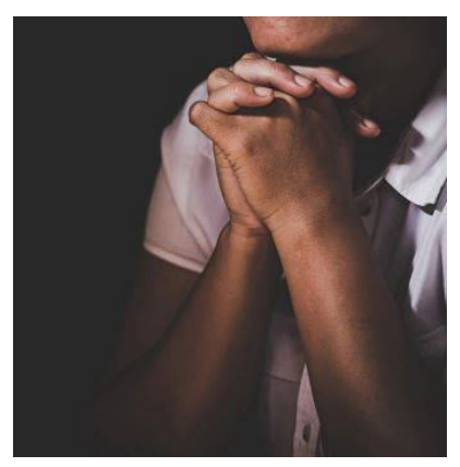
Remembrance of your deceased loved ones

During the month of November, we are called to remember our deceased loved ones and pray that they be released from Purgatory. We will have a box at the front of the church. You can place the names of your loved ones on a piece of paper or envelope and drop it into the box. All the Masses celebrated in November will include everyone whose names are in the box.